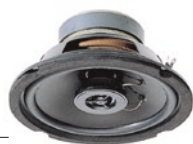
with professional 2-way-coaxial-chassis