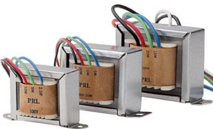
„L“ at the end of the model designation means: With connecting cables.