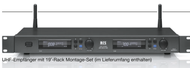
UHF-Empfänger mit 19"-Rack Montage-Set (im Lieferumfang enthalten)

The frequencies used are generally assigned for professional users. It is no longer necessary to register for use.