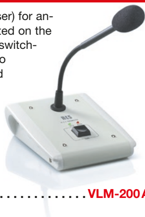
Microphone Station ..... VLM-200A for VLA-602A

Microphone station (condenser) for announcements in zones selected on the amplifier. With activated dip-switches (rear panel) it is possible to add a all call with priority and pre-chime. Connection via RJ45 socket. With busy indicator.