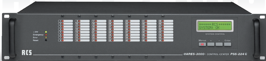
Picture shows PSS-224 C in a full option version

Modular expandable in steps of 8 from 8 to 224 lines